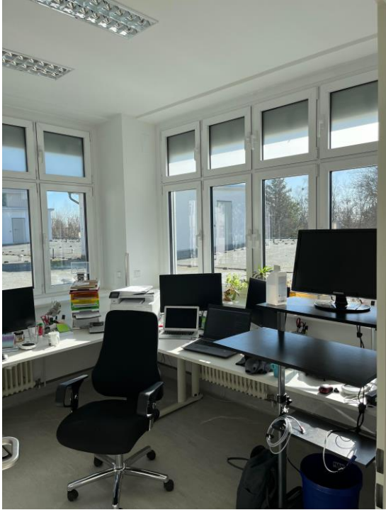
My very sunny office.