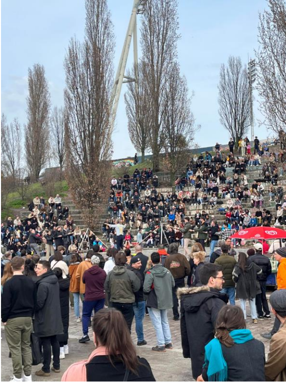
Mauerpark on a Sunday, there is a market and it's full of people and some interesting shows.