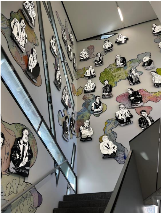
I visited the Jewish museum in Berlin.